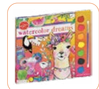
Klutz Watercolor Dreams