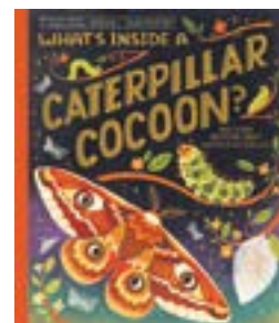
What's Inside a Caterpillar Cocoon?