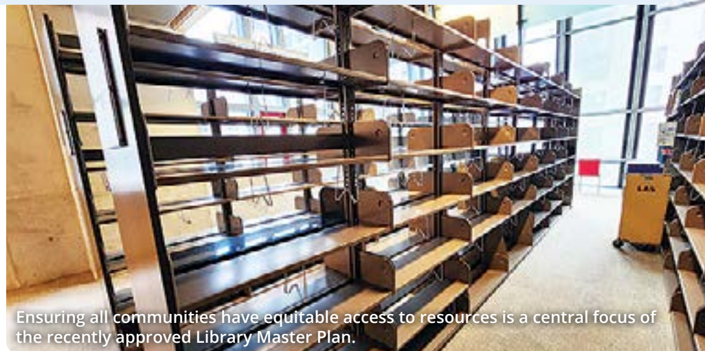
Ensuring all communities have equitable access to resources is a central focus of the recently approved Library Master Plan.