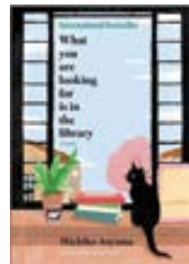
What you are looking for is in the library