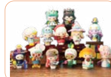
Momiji Book Shop Series - Collectible Kawaii Toy figures in a Book Shop Theme