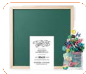
The TypeSet Co. Magnetic Message Board