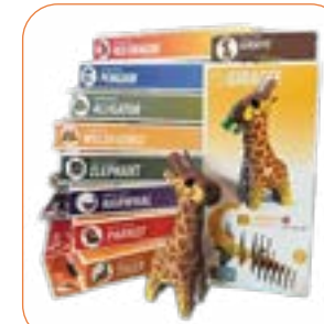
Eugy 3D Cardboard Model Kit