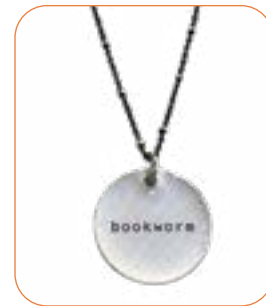
Bookish Necklace (variety of messages)