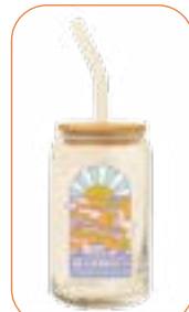
Good Vibrations Can Glass with Lid and Straw